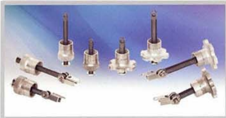
Avionics Retaining Hardware