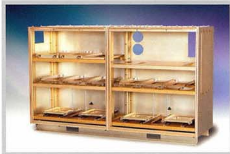
Precision Fabricated Structures